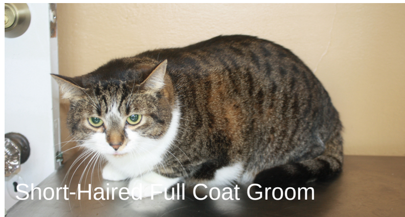
Short-Haired Full Coat Groom