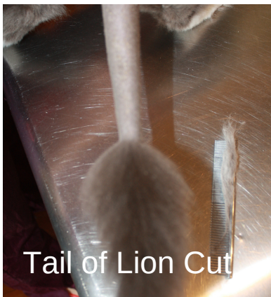
Tail of Lion Cut