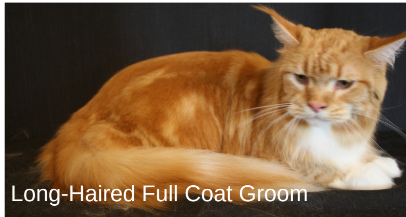
Long-Haired Full Coat Groom