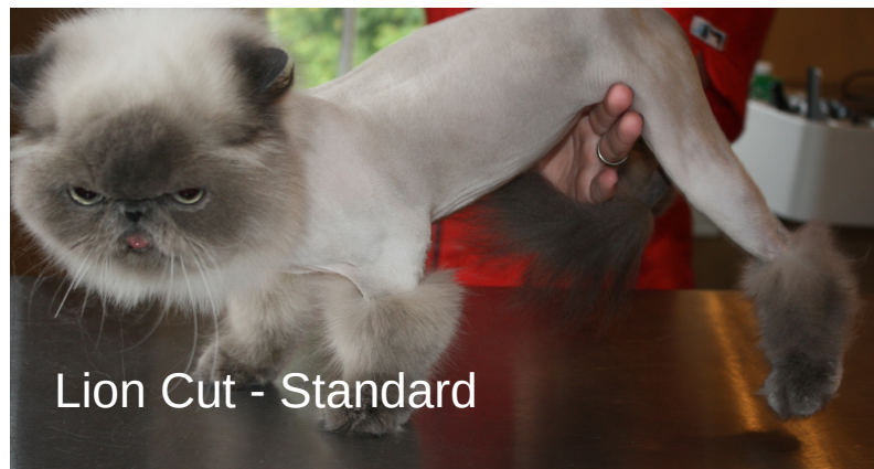
Lion Cut - Standard