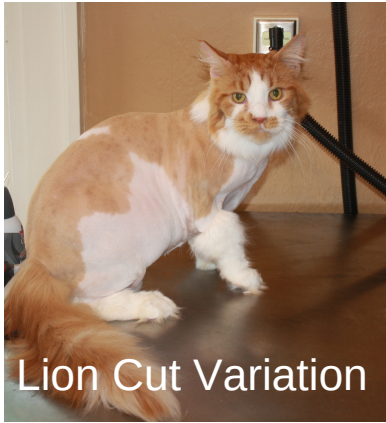
Lion Cut Variation